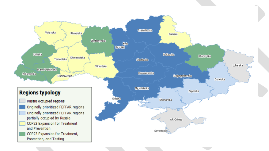
Figure 1.3. Ukraine's regions typology showing PEPFAR assistance